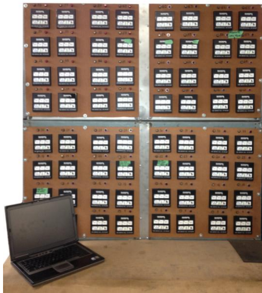
Multi-Floor System Access "Intelli-Gen" Programming