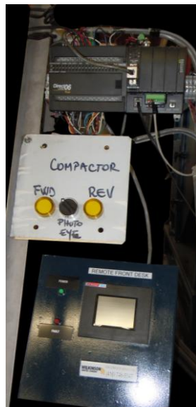
PLC SYSTEM TEST STATION With "Front Desk" Remote 24/7 "Touch Screen" Control System