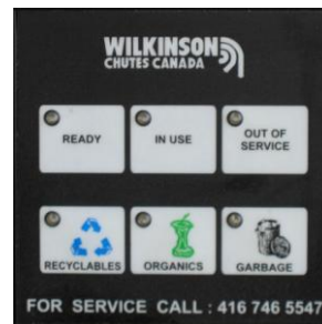
Resident Selector Panel & Control Panel Display on Non-Lockout systems