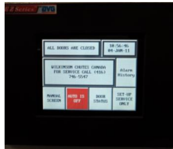
"Touch Screen" Controls Lockout System