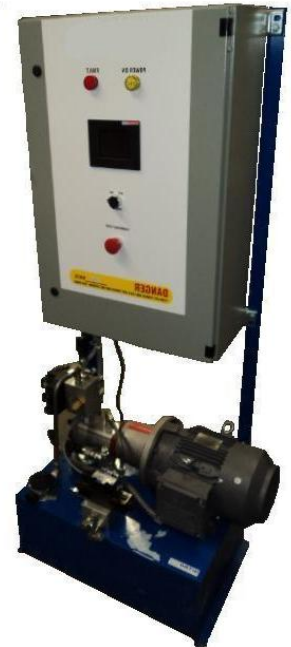
Integrated PLC Controls Sorter & Compactor System Power Unit